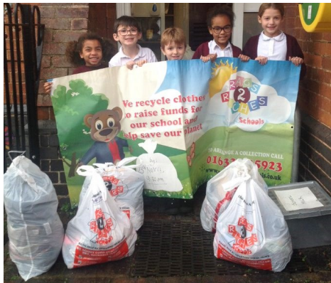
Older members of our Eco team!

Thank you to everyone who brought in their bags of unwanted clothing for the charity fundraiser. We are pleased to announce that we received 60 bags, totalling a weight of 259.6kg, raising £103.84 for the school! A big thanks must also go to the Parents Association for organising this event to raise funds for school.