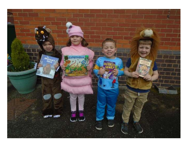
Celebrating World Book Day